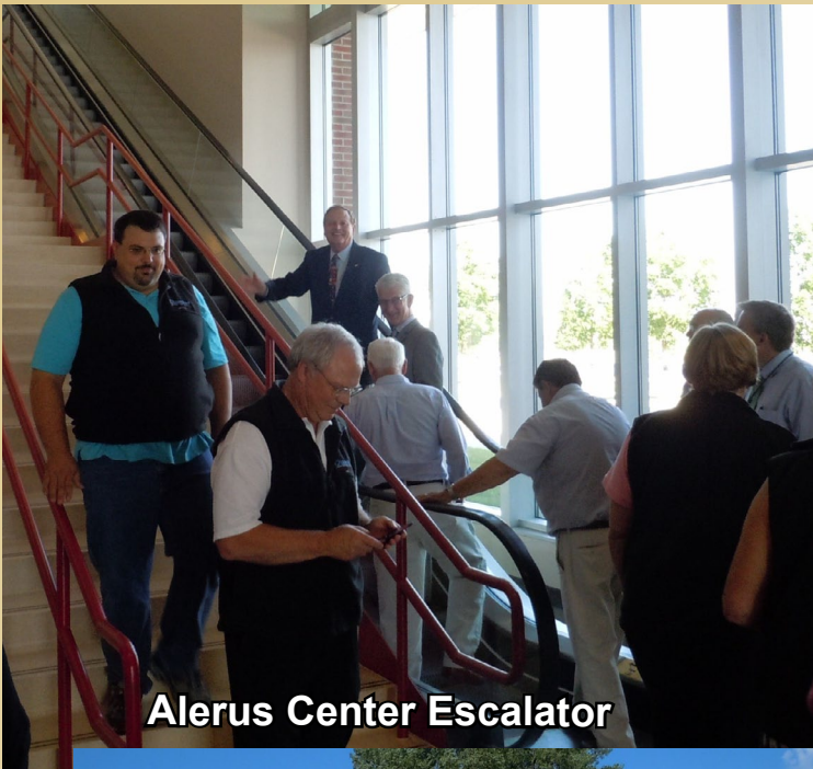
Alerus Center Escalator