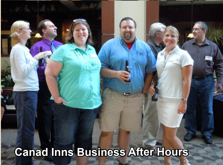
Canad Inns Business After Hours