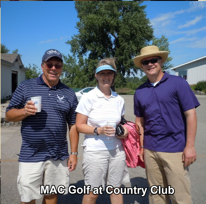
MAC Golf at Country Club