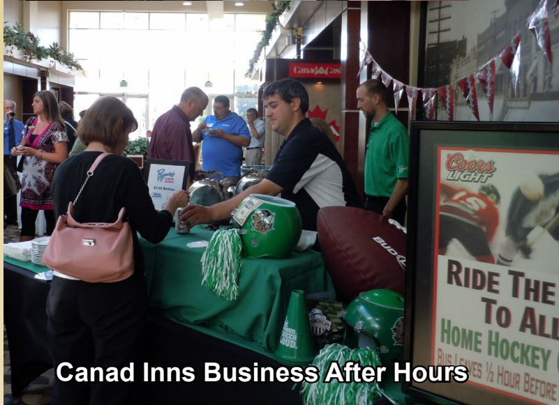
Canad Inns Business After Hours