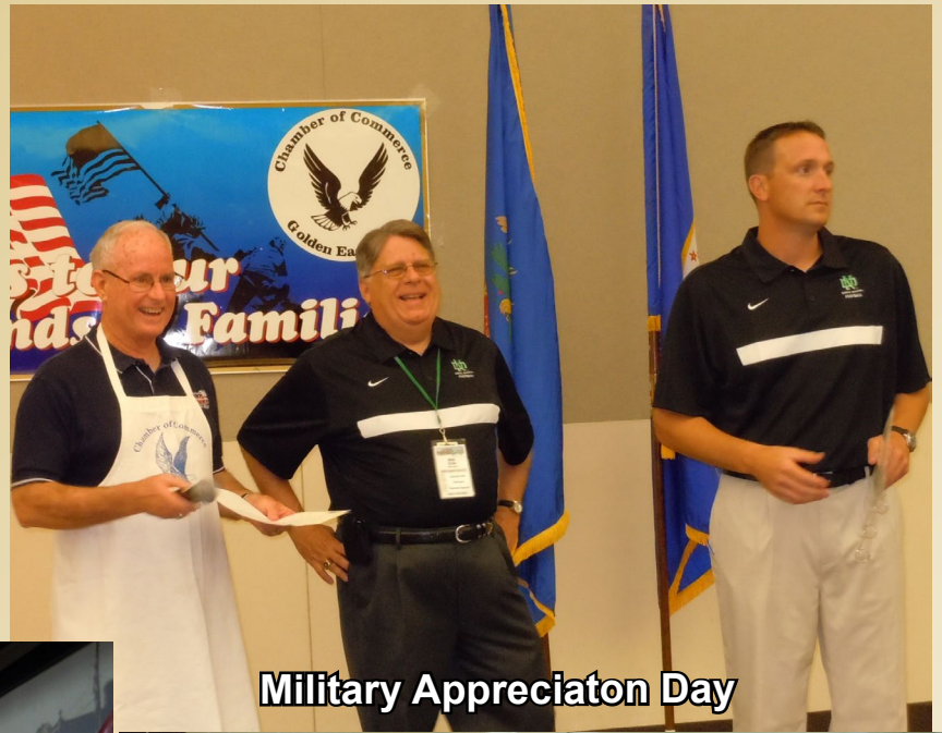
Military Appreciation Day