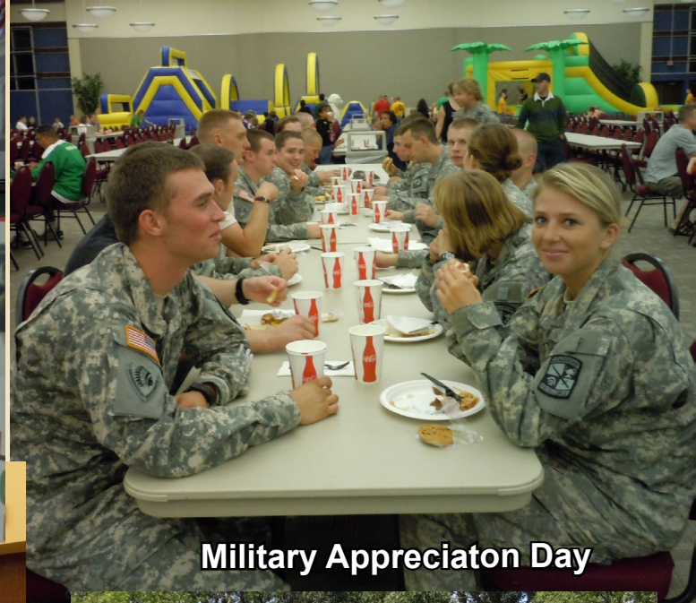
Military Appreciation Day