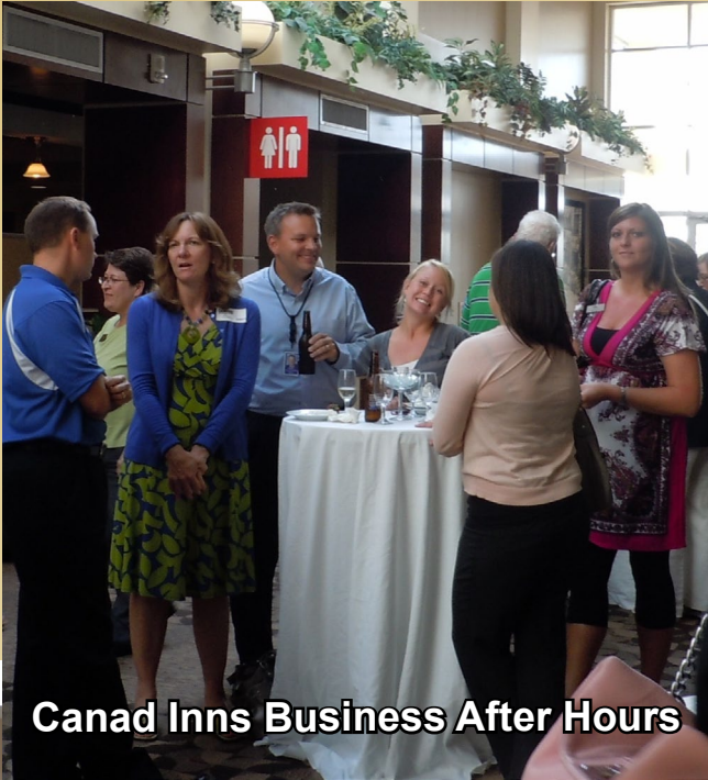
Canad Inns Business After Hours