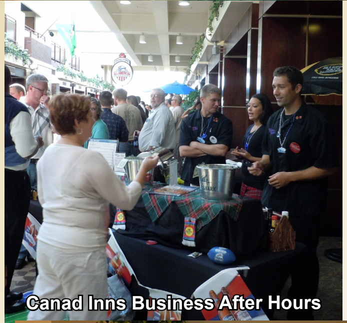
Canad Inns Business After Hours