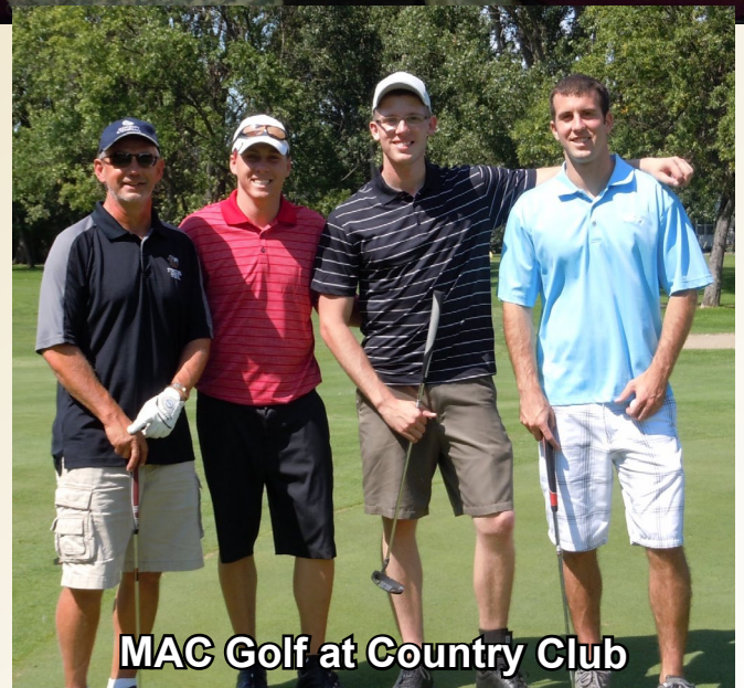
MAC Golf at Country Club