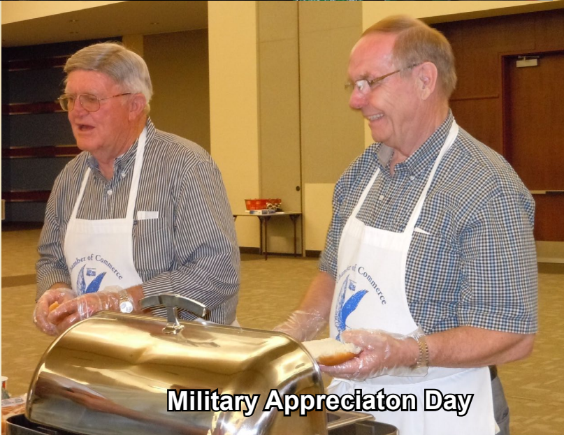
Military Appreciation Day