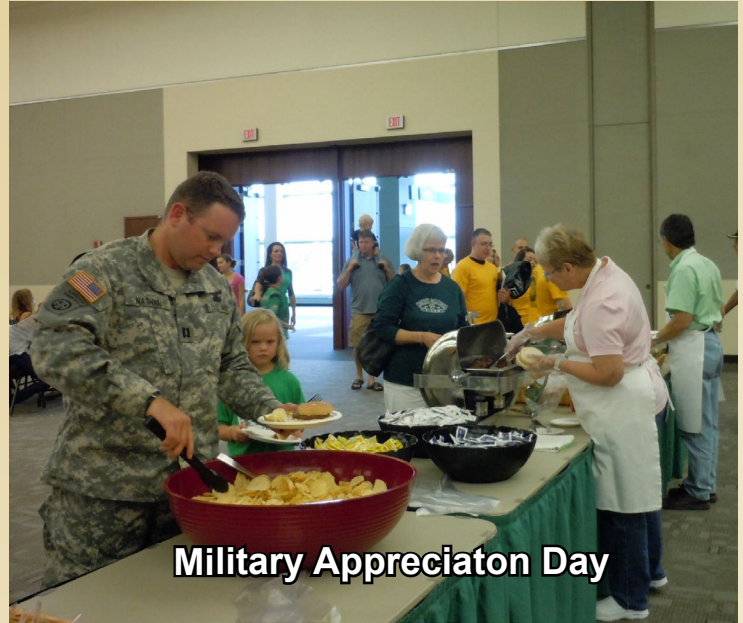
Military Appreciaton Day