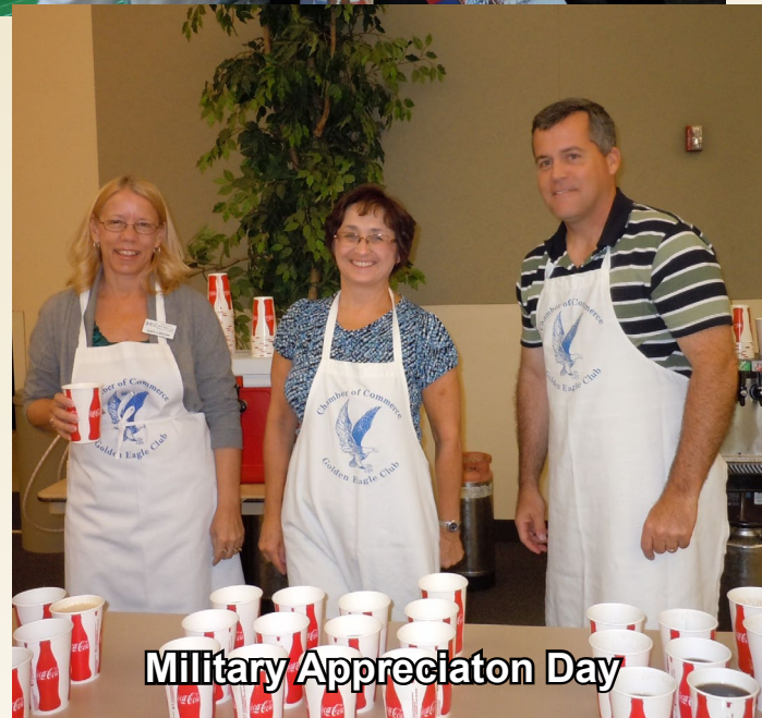
Military Appreciaton Day